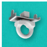
Twist End Stops x2