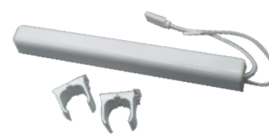
USB-C CHARGEABLE BATTERY WITH CLIPS 17AMS8PC