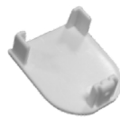
END CAPS X1 17CLEC1W