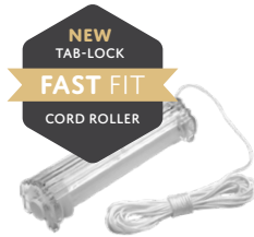
NEW TAB-LOCK FAST FIT CORD ROLLER FAST-FIT TAB LOCK CORD ROLLERS WITH 3.5M CORD 17CTCR35