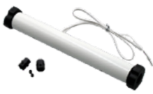
MOTOR & RECEIVER KIT PRE-INSTALLED INSIDE THE HEADRAIL 17AMMOTR