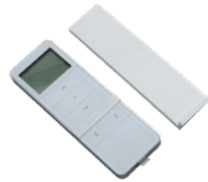
HANDHELD MULTI-CHANNEL REMOTE + HANGER 17AMRC15