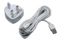
USB-A TO USB-C PLUG & CHARGER 17AMPGBP