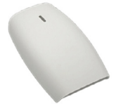
SMART HOME HUB 16GAASHH