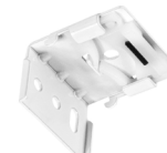
CLICK/SPRING RELEASE BRACKET 17CLCB1W

SEE CATALOGUE FOR ROMAN BLIND BARS & TAPE